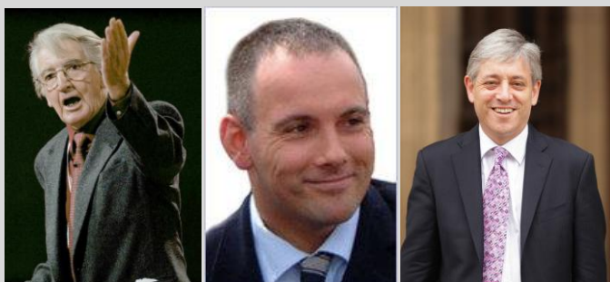
The Speaker's Choice

The TSR parties are a major part of what makes us such a vibrant community and once settled within a party, contributing in the main forum becomes easier!